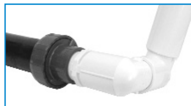
New Tap't™ Hybrid Coupling

LASCO Tap't™ Hybrid Coupling must be used with a "P" Inlet LASCO Swing Joint. The "P" inlet has the 1-1/2" ACME mating threads and a second inlet elbow which is crucial for the flexibility of the system. Warranty is void without the use of a "P" Inlet style Swing Joint.